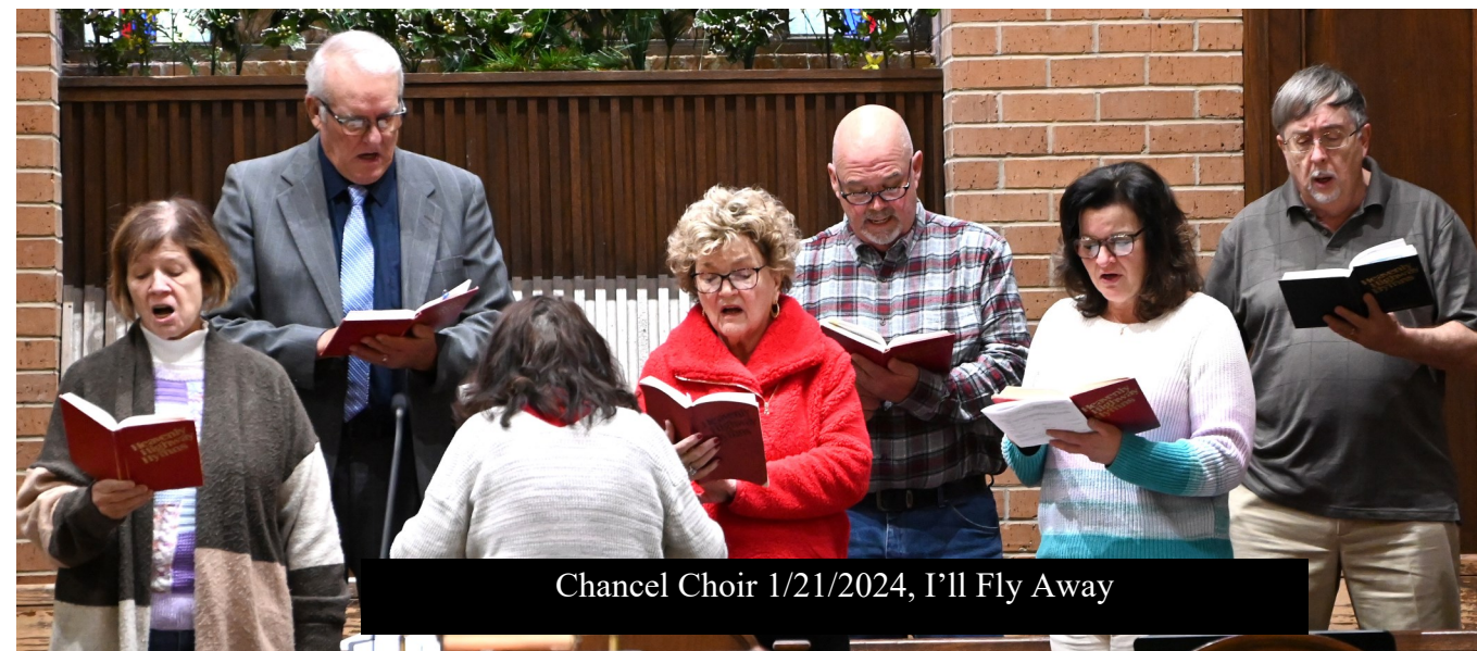
Chancel Choir 1/21/2024, I'll Fly Away