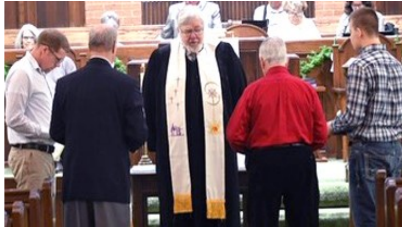
Offertory Prayer 1/07/2024